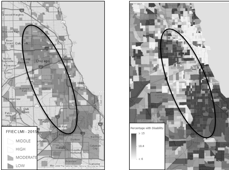
MAP 1 (LEFT): LMI NEIGHBORHOODS IN CHICAGO AREA 79 MAP 2 (RIGHT): PERCENTAGE WITH DISABILITY 80

city of Chicago and the Chicago Metropolitan Statistical Area, yet they make up 12% to 17% of some LMI neighborhoods. 78